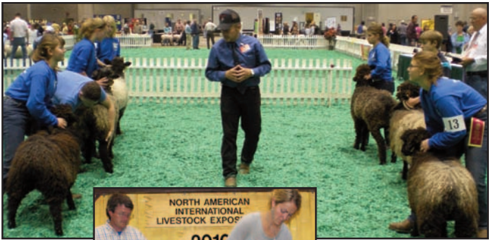
CHAMPION EWE LINE-UP AT THE NAILE JR SHOW.