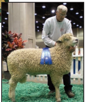
LEIN'S BEST FLEECE WHITE LINCOLN RAM AT THE 2010 NAILE.