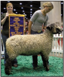
PETTERSSON'S CHAMPION NATURAL COLORED LINCOLN EWE AT THE 2010 NAILE.