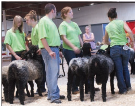
LINCOLNS READY FOR THE SHOW RING AT THE NE YOUTH SHOW.