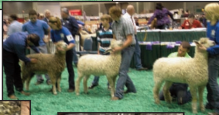
WHITE YEARLING EWES AT THE NAILE JR SHOW.