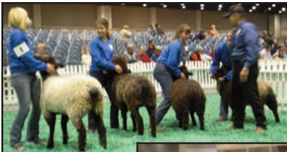
NATURAL COLORED YEARLING EWES AT THE NAILE JR SHOW.