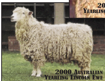
2000 AUSTRALIAN YEARLING LINCOLN EWE