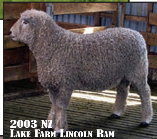
2003 NZ LAKE FARM LINCOLN RAM