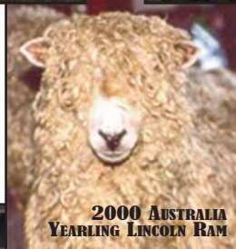
2000 AUSTRALIA YEARLING LINCOLN RAM