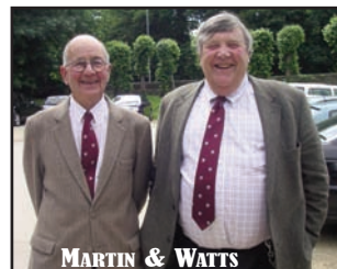
MARTIN & WATTS

The history of Lincoln sheep starts before Roman times, but in England it is closely tied to Lincolnshire. Wool was the common standard of wealth in the early days that was used to build the economy and the famous churches of Lincolnshire. Lincoln Cathedral has three acres of roof surface and Louth parish boasts the tallest church spire in England. The North Sea coast city of Boston was at one time the second largest wool center and its large cathedral is a testament to wool wealth. The central beam of the arched ceiling has a Lincoln Longwool carved at its center as testimony that wool created Boston's wealth and growth.