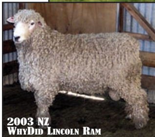
2003 NZ WHYDID LINCOLN RAM