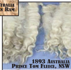
1893 AUSTRALIA PRINCE TOM FLEECE, NSW