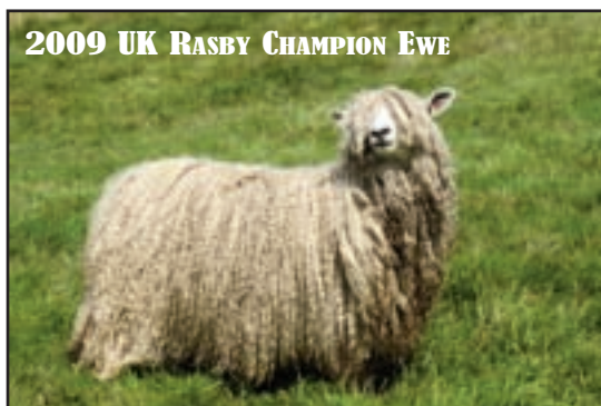
2009 UK RASBY CHAMPION EWE